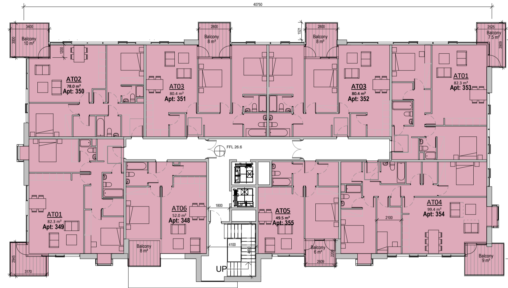
2 Block 05 - Level 01 Part V 1 : 200